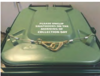
Snaphooks unlocked for collection