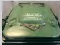
Snaphooks unlocked for collection

Remember to unclip your locks on collection day.